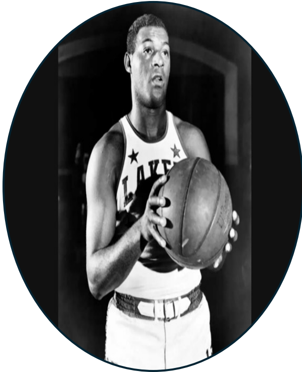
1959 Elgin Baylor Los Angeles Lakers