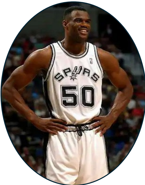
1987 David Robinson San Antonio Spurs